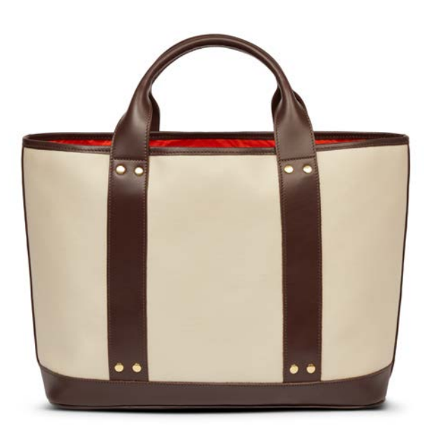
SOLEIL | £375