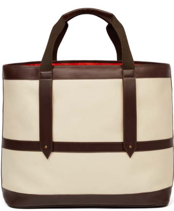
SAIL | £425